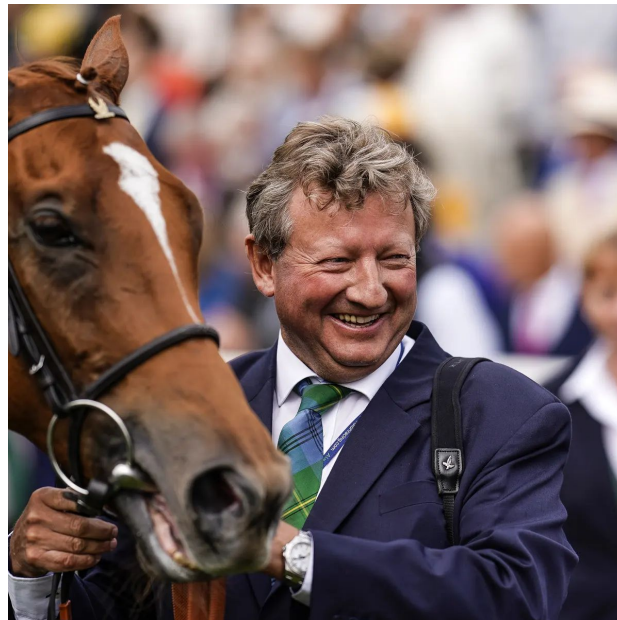
The familiar grin of Mark Johnston.