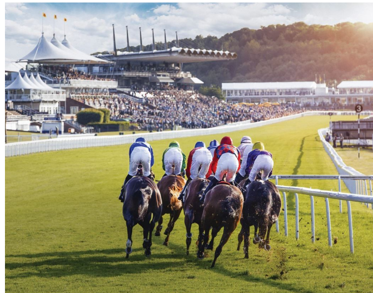
The sharp, downhill finish at Goodwood Racecourse.

With no fewer than 13 Group races, including three Group 1's as well as numerous hotly contested big field handicaps there will be plenty of heroes and future legends of the sport emerging from this 5 day bonanza.